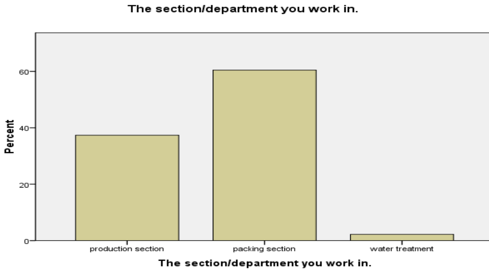
Figure 3: Section/department